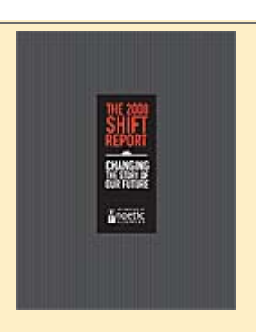
The 2008 Shift Report: Changing the Story of Our Future

You can get a <u>PDF</u> or <u>hard</u> <u>copy</u> of this year's Shift Report at the Bleepstore.